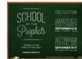
School of the Prophets September 12th - 17th 2016

Marriage Retreat - 7th to 9th October 2016