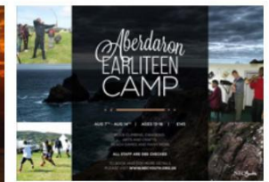
Aberdaron Camp check NEC website for dates