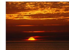
Tonight – 19:11 Friday 23 rd – 18:57

You can also write a note with your request and contact details, then put it in the offering basket.