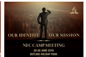
NEC Camp Meeting 20th-26th June 2016