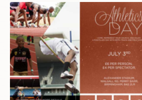
Athletics Day 3rd July 2016