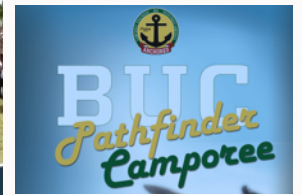
BUC Pathfinder Camporee 31st July - 7th August 2016