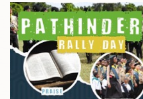
Pathfinder Rally Day 16th July 2016